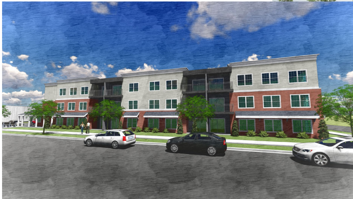
Lofts at Lumber Square, Petoskey