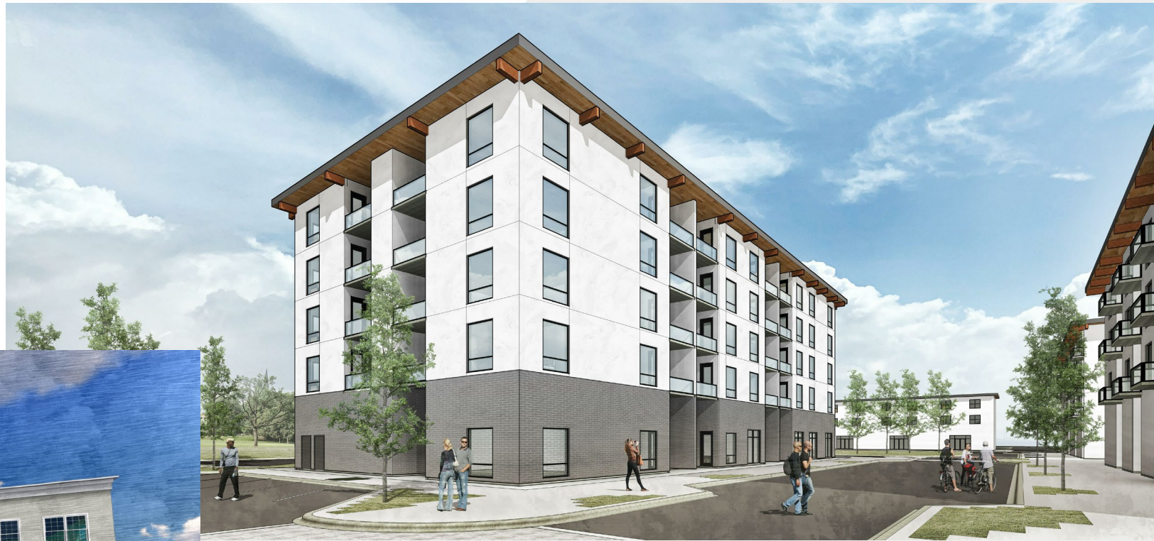
Victories Square, Petoskey